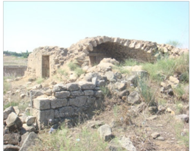
Figure 8 Archaeological excavations in the eastern part of the Nardaran Historical site and Cultural Reserve.

Sourkhane, the historical-cultural value of these traces became doubly remarkable. The Atashgah temple was related to the 18 th century. During carving it was found that the Atashgah was constructed on an older temple. During this research, some buildings related to the 18 th century including several gas wells, ovens, and Places of animal sacrifice were found. Pottery pieces and Dukatin coins minted in 1841 were among their findings. Gas channel found in this area was interesting. There were mud covered gas channels in all the rooms of the temple.