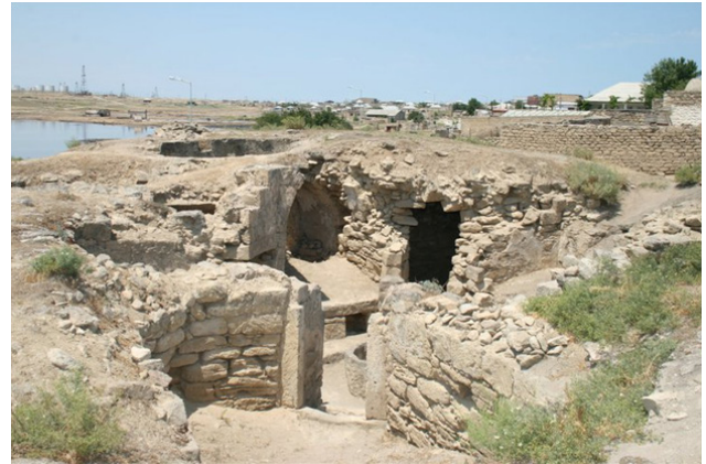
Figure 6 Historical Qum bath in archeological site.

During the excavations, some historical traces related to the 13th-18th centuries were found including some glazed pottery that indicates the civilization and business development in the 10th-14th centuries. Some dishes in the downtown had the builder's seal. This demonstrates the existence of the Pottery workshops in this place. Also, remains of Pottery ovens were found in this place. Apsyden tablets related to the second or third millennium BC, Remains from the Bronze Age and many flint knives were found in this place. These findings show the background of historical villages of the Abshiroun, such as Mardakan, Buzurna, Sourkhani, Amirjan, and Zigh is from ancient centuries (Figure 5)(Figure 6). 8