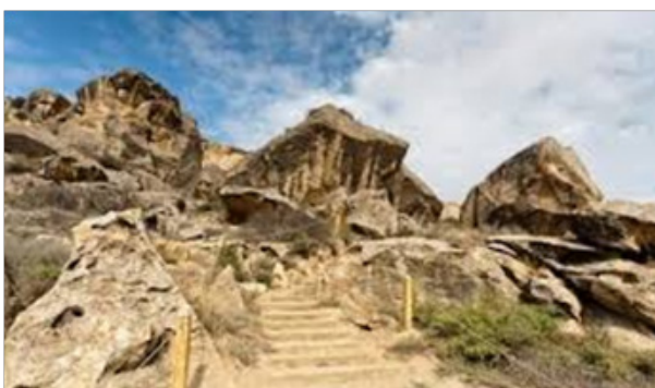
Figure 1 Qubostan prehistoric Archeological site.