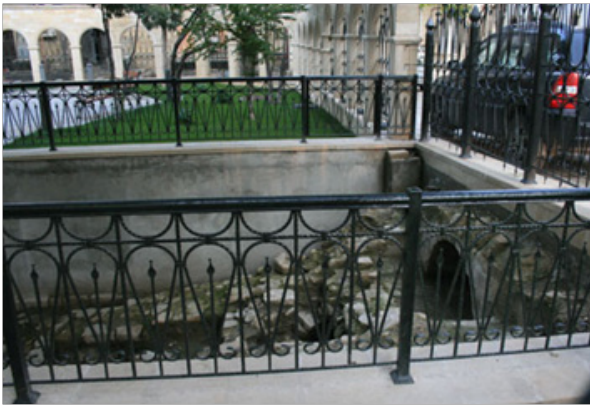
Figure 4 Archeological park in in Icharishahar.

During the excavations, some historical traces related to the 13th-18th centuries were found including some glazed pottery that indicates the civilization and business development in the 10th-14th centuries. Some dishes in the downtown had the builder's seal. This demonstrates the existence of the Pottery workshops in this place. Also, remains of Pottery ovens were found in this place. Apsyden tablets related to the second or third millennium BC, Remains from the Bronze Age and many flint knives were found in this place. These findings show the background of historical villages of the Abshiroun, such as Mardakan, Buzurna, Sourkhani, Amirjan, and Zigh is from ancient centuries (Figure 5)(Figure 6). 8