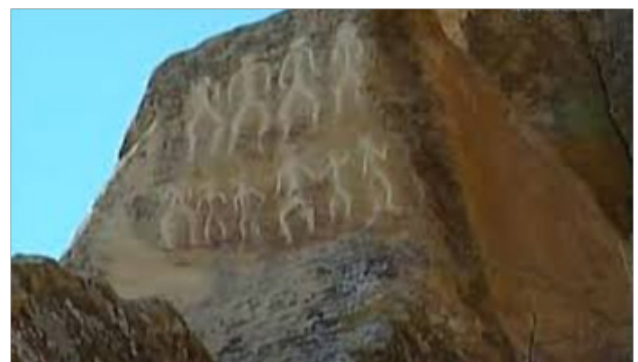
Figure 2 Qubostan prehistoric Archeological site.

several archaeological excavations were implemented. During these excavations, a rich civilization was discovered. It was demonstrated that Baku city was a residential place. It was shown that there were an extensive business system and different industries as well as urban setting of different periods. In order to study the history and civilization of the old city, important archaeological research and excavations were performed by the historical museum of Azerbaijan in the years 1924-1925 and 1945-1946. During excavation in the Shirvan Shah's palace grounds, near the tomb, significant historical materials were discovered. Near the tomb, the remaining traces of a mosque, consisting of several parts near the tomb's wall as a network layout was revealed. In that place, the remains of the walls of buildings were extracted. During excavation, copper coins minted by the Seljuk and Shirvan Shah government were found. This shows that these buildings dated back to the Eleventh and twelfth era and the Darvish's tomb in the Shirvan Shah's palace had been built before that time. 4