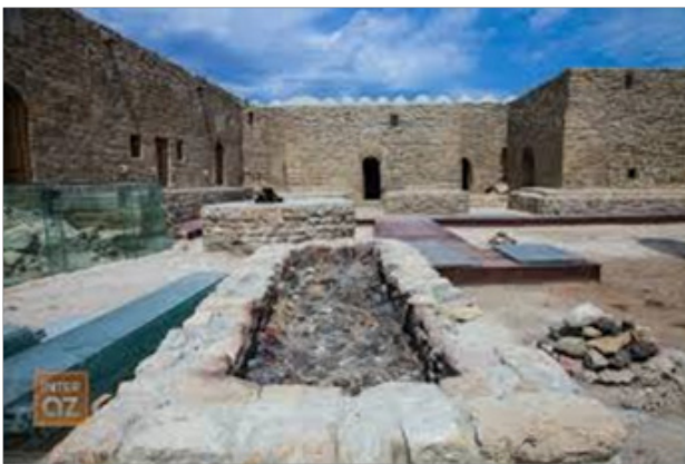
Figure 10 Atashgahthe State Historical-Architectural conservation site.