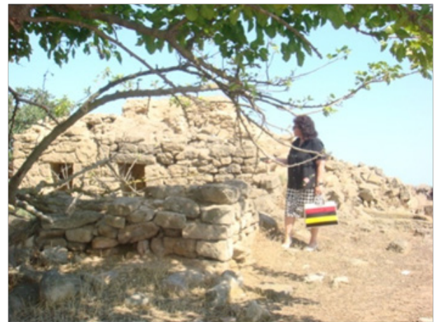
Figure 7 Archaeological excavations in the eastern part of the Nardaran Historical site and Cultural Reserve.