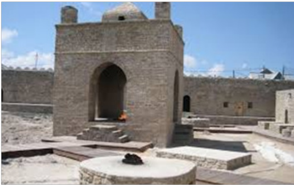
Figure 9 Atashgahthe State Historical-Architectural conservation site.