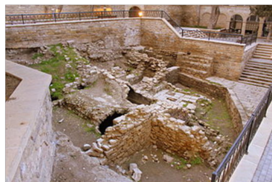
Figure 3 Historical Church in Icharishahar.

In the years 2010-2012, during the excavations in the protected area of the Jewelers area, a painter discovered underground passages, 2 graves, and a living room with roof and vault. Based on the findings in this protected area, there were gardens with traces in the upper part of the city. Careful analysis of the protected areas of the old city and programmed excavations around the castle are necessary to open up the multi- layer civilization of this city. We hope that this research brings up some serious attention to highlight the importance of Baku's archeology (Figure 3)(Figure 4). Historical protected area of the Qala: performed excavations in this area convince us to reconsider the history of the human life in this area. For some long years, it seemed that Abshiroun was created in the mediate era, but in the recent years, some excavations have shown that this castle was created in the Bronze era. First discoveries were obtained in the southern part of the village. Stone architectural constructions, Pottery pieces, and residential places were found in this place. At the same time, during the investigation on the bathroom remained from 14 th and 15 th centuries, some knives made of the flint and tablets were found near the Qale salt lake. At the end of 2007, the archaeological excavations started around the southern part of the castle (Qala) and some historical traces were found related to the Bronze era.