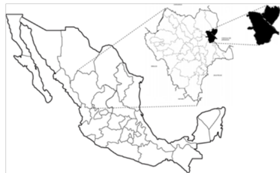
Figure 1 Location of the study area.

Fleas were collected during June to September 2016 in Gómez Palacio (25°32' and 25° 54' N, -103°19' and 103°42' O) and Lerdo (25°10' and 25°47' N, -103°20' and -103°49' O), both cities in Durango state, located at north-central part of México, at an average altitude of 1,150 and 1,140 msnm, respectively. Both cities have a very dry semi-arid climate, with a temperatura ranging from 14-22°C, summer rains (100-400mm), and a scrub and pasture like vegetation (Figure 1). 13,14