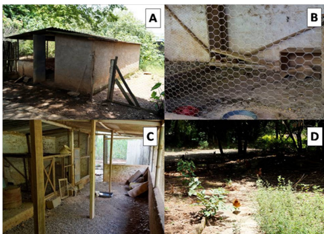
Figure 1 Places were sand flies were collected.

houses and a kennel with near 500 dogs located at the boundary of the highway area and a small forest (Figure 2). The others four traps were installed in an urban area nearby chicken houses (Figure 2). The second and most current source of information for the sand flies classification of the New World was proposed by Galati, 8 which uses 88 morphological characters in an attempt to resolve the characterization of sand flies. All collected phlebotomies were identified according to the Galati classification system. 8 Females were identified by transferring the guts of the sand flies to a drop of buffered saline on a microscope slide using a pair of mounted entomological pins. A cover slip was then placed over the drop and the thorax, sperm thecae and ciborium were examined under an optical microscope. The male specimens were prepared and mounted. A cover slip was then placed over the drop and the thorax and ciborium were examined under an optical microscope.