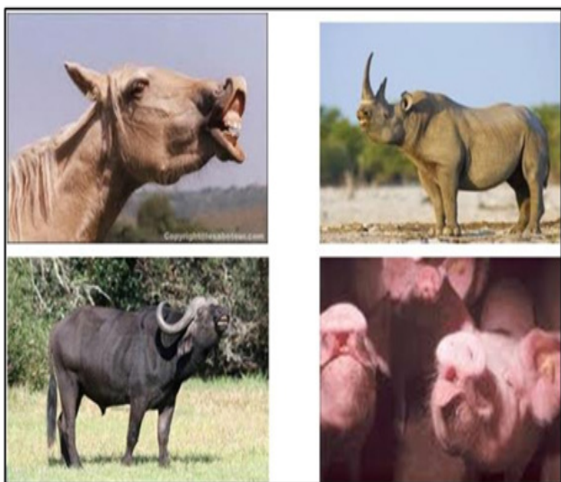
Figure 1 Flehmen reaction in different animal species.