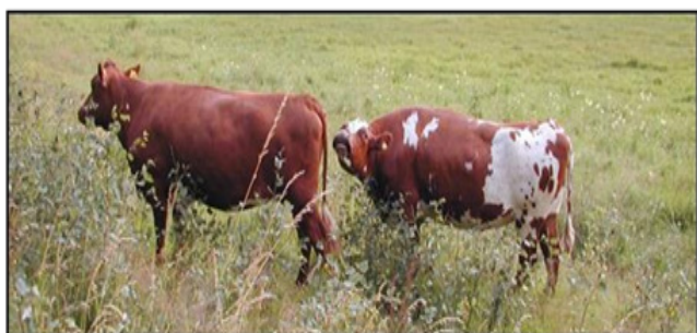
Figure 2 Flehmen reaction in heifers.

Synthetic analogues of pheromones were until recently the most practiced in disinfection and for monitoring the size of the population of harmful insects and for preventing their reproduction. In domestic animals structural analogues of pheromones are used in reproduction. For earlier estrus manifestation gilts used pheromone boars, cows, sows and sheep pheromones which also apply for synchronizing ovulation. Pheromone represents the use of structural synthetic analogues of pheromones in therapy already manifested, and actual or potential behavioral disorders in domestic animals.