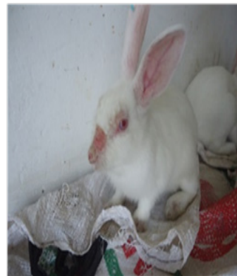
Figure 3 Alopecia in nose.