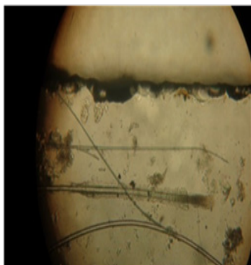
Figure 5 Direct microscopic.