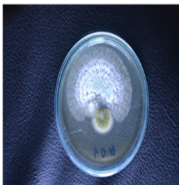
Figure 7 Fungal colony.