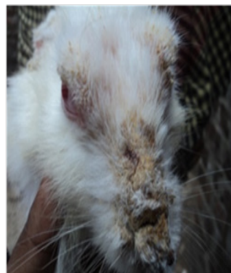
Figure 2 Alopecia in mouth.