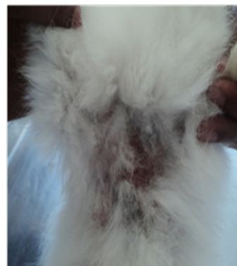
Figure 1 Alopecia in abdomen.

The obtained information was imported, stored and coded accordingly using Microsoft Excel -2007 and transfer to STATA/IC-11.0 (Stata Corporation College Station) for analysis. Prevalence was determined dividing the total number of fungal infected animals by total number of animal examined and multiplied by 100 to expresses in percentage. The association between the independent factors such as age, sex, body weight, and deworming status were evaluated using the Chi-square test ( \chi^2 ) and considered significant when p < 0.05 (Figures 1–9).