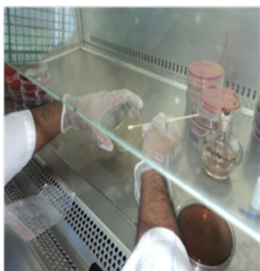
Figure 6 Fungal culture.