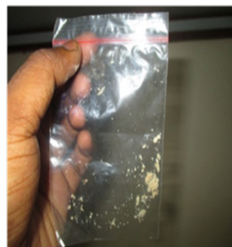
Figure 4 Skin scraping.