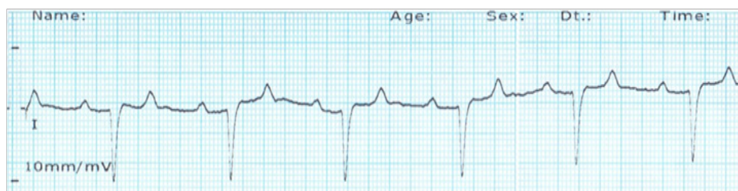
Figure 3 The electrocardiogram of healthy adult buffalo (Age-8years) in base apex leads system (paper speed 25mm/sec, calibrated 10mm/mV).

values were recorded. Data recorded in this study is useful as reference values for clinical evaluation of diseased buffaloes.