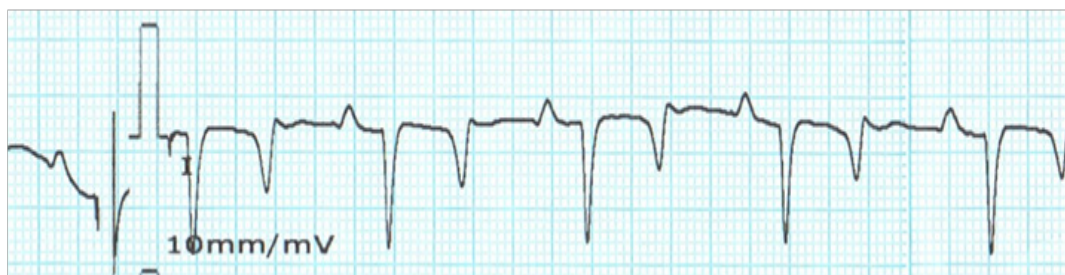
Figure 4 The electrocardiogram of healthy adult buffalo (Age-6years) in base apex leads system (paper speed 25mm/sec, calibrated 10mm/mV).