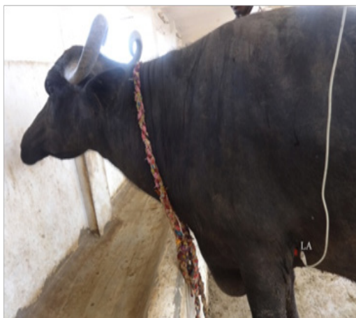
Figure 2 Placing of left arm (LA) electrode.