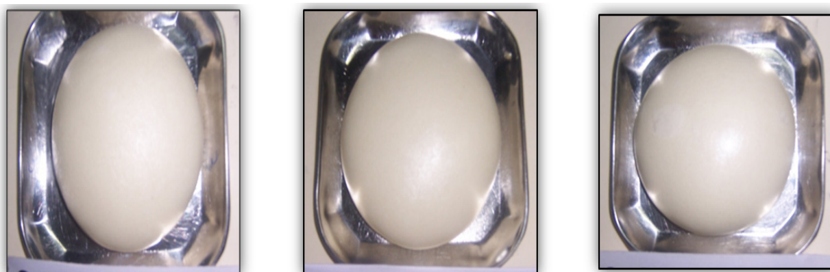
Figure 2A MCA made using 22% rennet casein. Figure 2B MCA made using 24.5% rennet casein. Figure 2C MCA made using 27% rennet casein.

MCA, mozzarella cheese analogue; MFFS, moisture in fat free substances; FDM, fat on dry matter; CD, critical difference