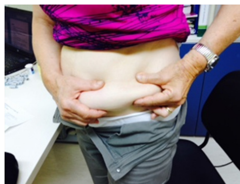
Figure 2 Abdominal flat lipohypertrophy area, becoming more evident than the healthy area after pinching. Right hand fingers pinch a thick fold in the presence of large lipohypertrophy plates while only a thin skin folds results from the left hand squeezing the area systematically free of insulin shots.