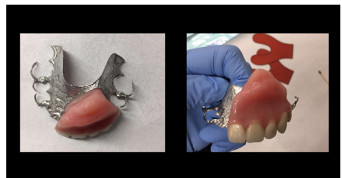
Figure 5 Extraoral view of definitive obturator.