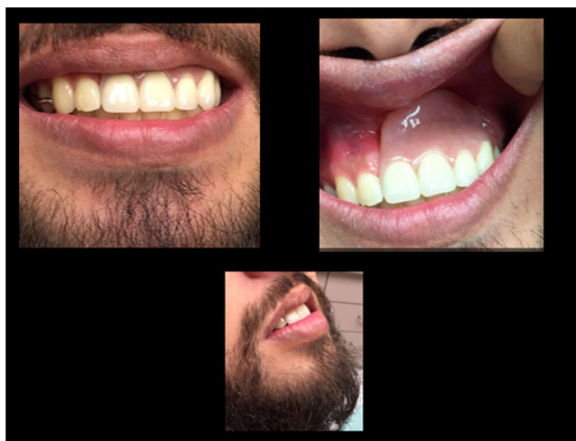
Figure 6 Intraoral view of definitive obturator.