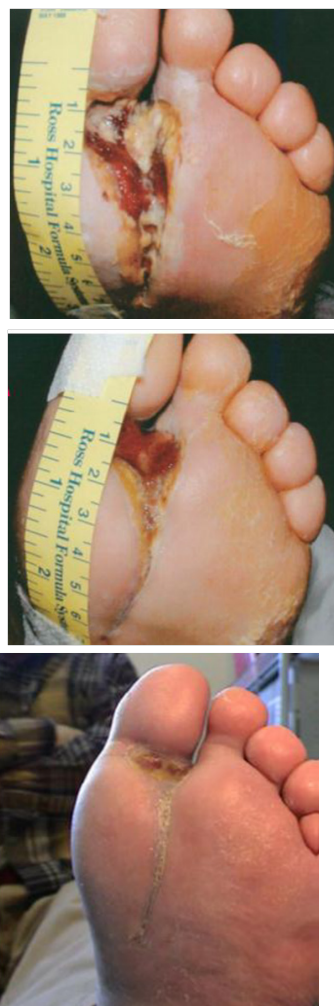
Figure 1 A: Wound present for one year and it was one day away from amputation; B: After 26 visits of HBO treatment, 100% oxygen at 2.4 ATA; C: After 50 visits of HBO treatment, 100% oxygen at 2.4 ATA. 21

It was noticed that the wound heal faster when the patient moves from thin mountain air to a richer atmosphere and oxygen is considered as the most essential for healing process, hence the HBO has the ability to enhance the wound healing in diabetic and other non-diabetic wound problems. 19 HBO therapy enhances the oxygenation, decreases the edema and modifies the healing and immune responses. The use of HBO therapy is covered as adjunctive therapy only after there are no measurable signs of healing for at least 30 -days of treatment with standard wound therapy and must be used in addition to standard wound care. 20 Figure 1, taken by Dr. Stoller, shows the effectiveness of HBO in treating a non-healing diabetic wound and proves the ability of HBO in saving up to 75% of diabetics from amputation. 21