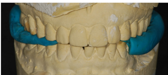
Figure 2 Final height registration.

The casts models and the bite registrations were sent to the prosthetic for confection of bilateral lower splints in acrylic resin. These devices overlaid the entire occlusal surface of molars, premolars and lower canines and the buccal and lingual surfaces just below the prosthetic equator of these teeth, reproducing the anatomical feature of each one (Figure 3). The reason of buccal and lingual surface trespass the prosthetic equator is to position the device in a retentive zone, promoting a more stable fixation of the devices. Bilateral splints could be either attached only by the fit or cemented using temporary material or glass ionomer cement. The advantage of not using a cementation procedure is the ease of cleaning, favoring the oral hygiene and biofilm control. However, by the cementation of the bilateral splints, a more stable condition was obtained and the occurrence of acrylic fractures diminishes. The bilateral splints were fixed upon the occlusal surfaces with glass ionomer chemically activated cement (Figure 4). Following, occlusion was checked and adjustments were performed aiming a harmonic distribution of the occlusal contacts.