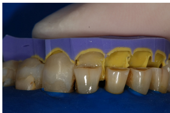
Figure 9 Stratification technique.