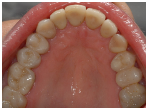
Figure 11 Intraoral superior occlusal view of teeth after treatment.