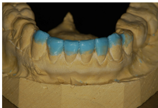
Figure 8 Concluded waxing.