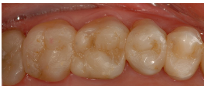
Figure 5 Occlusal adjustments on the lower splints to promote occlusal balance.