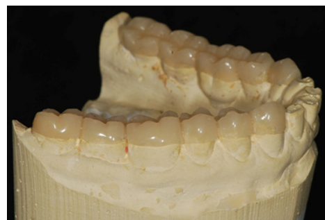
Figure 3 Finished and polished restorations, reproducing the anatomical feature of each tooth.