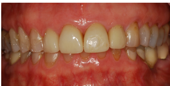
Figure 1 Periodontal condition stable prior to treatment.

rest position (facial muscle relaxation), satisfactory phonetics, and aesthetics and swallowing ability. 13 The intermaxillary distance of the re-established OVD (defined previously) was transferred to the casts models by bite registration with condensation silicon. Two portions of dense material were manipulated and positioned bilaterally on the occlusal surface of lower posterior teeth. The Willis Bite Gauge 12 set on the re-established OVD was positioned on the patient's chin, without pressing the soft tissues. The patient was told to occlude and stay motionless when the upper fixing rod of the Willis Gauge touched the base of the nose, so it could wait for the final solidification of the material. At the end of the procedure we had the models and the height registration that would be re-established, which was about 3mm (Figure 2).