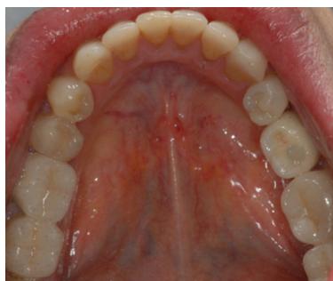
Figure 12 Intraoral inferior occlusal view of teeth after treatment.