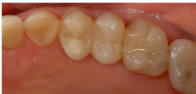
Figure 6 Final occlusal adjustments on the lower splints.