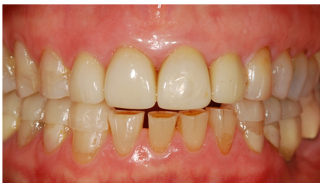
Figure 4 Bilateral splints fixed upon the occlusal surfaces with glass ionomer cement.