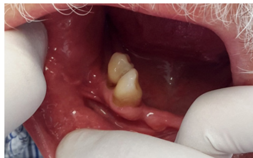
Figure 2 Fibrous tracts connecting jugal with gingival mucosa at premolar level, which has abfraction and cavities.