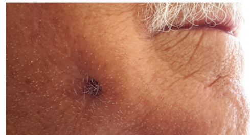
Figure 1 Cutaneous hole on the right cheek with retraction of the surrounding skin.

abfraction of the same exact dental piece, nerve root being completely exposed (Figure 2). Based on these findings, the patient was referred to stomatology to have the fistula treated. Panoramic x-ray identified periapical radiolucency in tooth number 44 and fillings in pieces 43 and 44 (Figure 3). The patient is now waiting endodontic treatment.