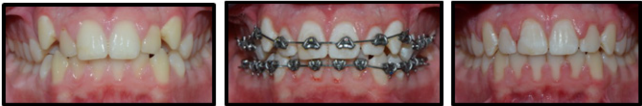
Figure 1: Before, during, and after frontal photographs of Angle Class I malocclusion treated in 96 days (Courtesy of Dr. Patrick Assal, Lausanne, Switzerland).

Three adult patients, seen by three different providers presented for orthodontic treatment with Angle classifications of Class I, Class II and Class III respectively. Full maxillary and mandibular fixed appliances followed by retainers were applied for all three cases. Treatment time for the three patients presenting with Class I, Class II and Class III malocclusions took 96 days, 72 days and 117 days respectively (Figures 1-3).