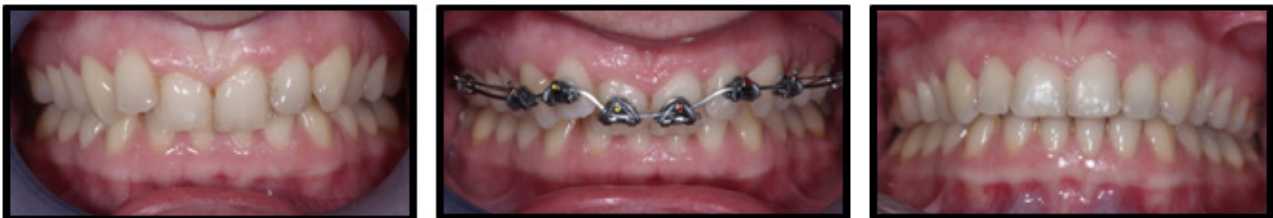
Figure 2: Before, during, and after frontal photographs of Angle class II malocclusion treated in 72 days (Courtesy of Dr. Melissa Goddard, Liverpool, United Kingdom).