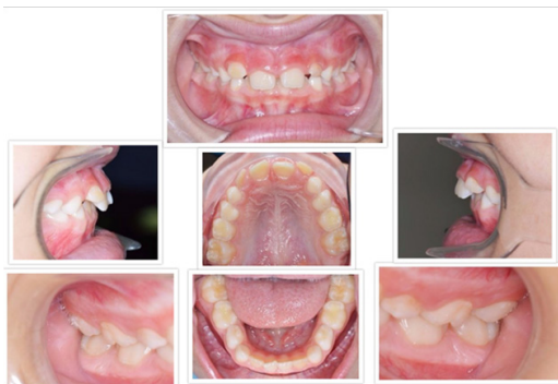
Figure 1 Pre-treatment intraoral photos.