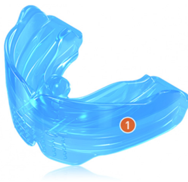
Figure 3 The Myobrace K1 appliance.