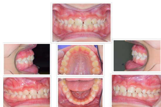
Figure 5 Post-treatment intraoral photos.