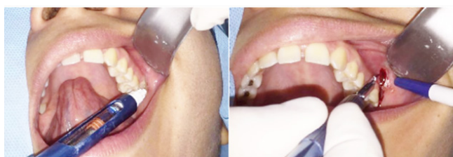
Figure 1 Infiltrative anesthesia/Incision in the oral mucosa.