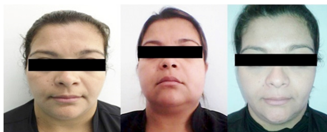
Figure 3 Initial/Post operative 3 days/Post operative 30 days.