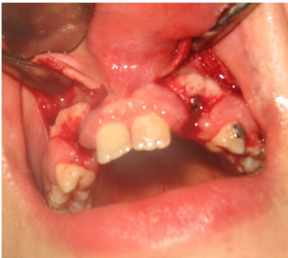
Figure 6 Intraoral picture of the elevated flap with exposure of the surgical site with extraction of the deciduous canine teeth and immediate implant insertion.