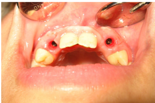
Figure 8 Intraoral picture after exposure of the dental implants showed improve the gingival biotype.