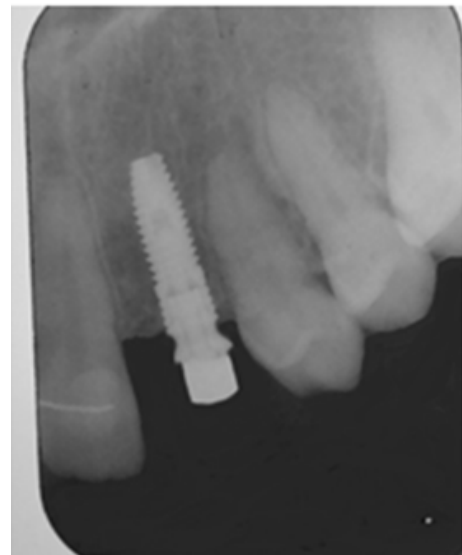
Figure 10 Intraoral periapical x-ray view for the implant inserted in the right side (with membrane) showed preservation of the crestal bone around the dental implant.