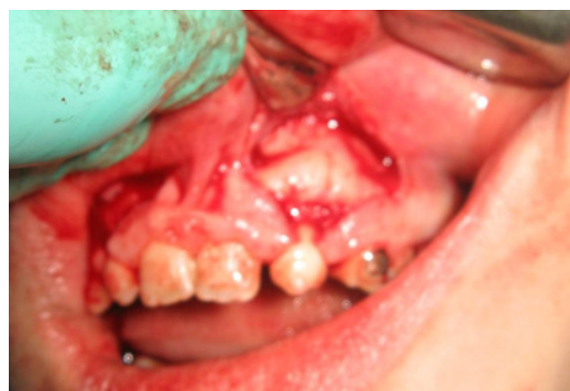
Figure 4 Intraoral picture of the elevated flap with exposure of the surgical site in the left side.