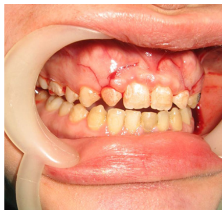
Figure 3 Intraoral picture for the Outline of the aesthetic flap design in the right side.

The mean difference is highly significant if P value > 0.01