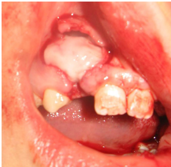
Figure 7 Intraoral picture of the used membrane to the cover the surgical site in the right side.