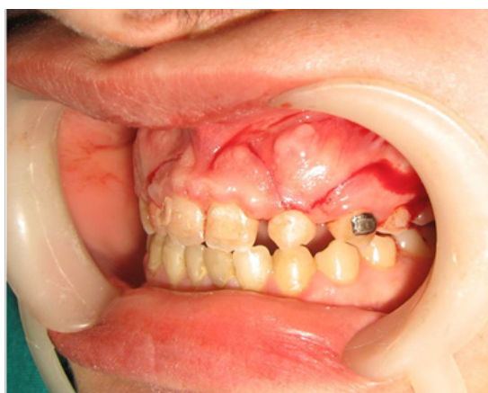
Figure 2 Intraoral picture for the Outline of the aesthetic flap design in the left side.