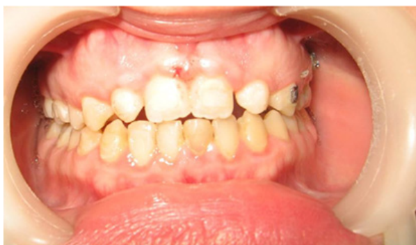
Figure 1 Preoperative intraoral picture of patient with congenitally missed upper lateral incisors and retained deciduous canine teeth.