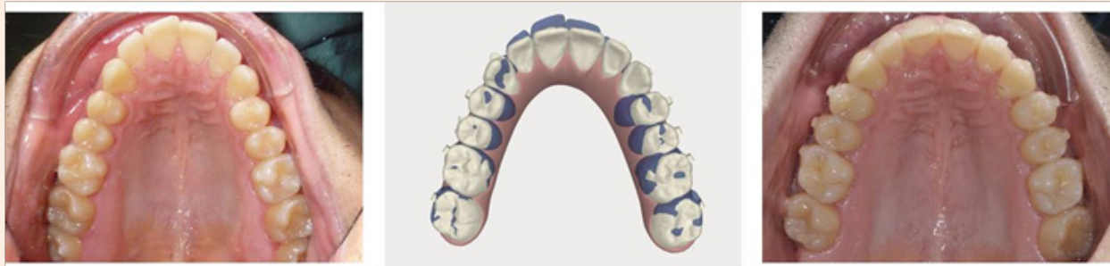
Figure 1: patient upper arch before and after treatment and Clincheck image.

underneath the flap and interproximal corticotomies extended through the entire thickness of the cortical layer, just barely penetrating the medullary bone were performed between the dental roots following the long axis of the alveolus and stopping at a distance of 2 mm from the papilla up to the vestibular fornix, 4-5 mm above the apex of the teeth, not penetrating the maxillary sinus. Endoscopic assistance through fiber optic was not necessary because of the direct sight allowed by the frenula incisions. An established augmentation procedure was performed in this case. The suture of the vertical incisions using PGA 3-0 thread ( Omnia S.p.a, Fidenza, Italy ) in the muscular layer and Silk 3-0 thread ( Ethicon, Johnson & Johnson, Somerville, NJ, USA ) on the mucosa complete the surgical procedure. Prophylactic amoxicillin 2 gr per day medication was prescribed for one week; pain killing was achieved using Paracetamol 500 mg + Codeine 30 mg three times a day restricted to the first postoperative days to avoid interference with the RAP. Orthodontic treatment was resumed on the same day using Invisalign® aligners. During the RAP phase aligners were changed every 5 days, reducing of about one third the normal protocol of aligners changing (14 days).