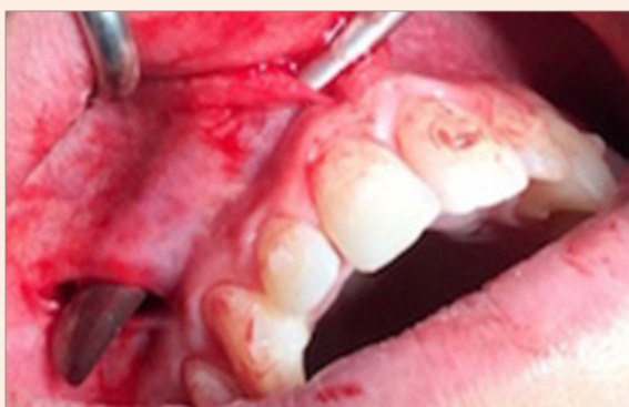
Figure 2: The minimally invasive surgical access.