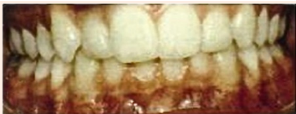
Figure 1: Intraoral photo [1].

It often demonstrates dermatological diseases, tumors and other pathology of the head and neck. We can diagnose important health issues by taking the time to look. Diagnosing diseases of the skin in our patients, e.g. squamous cell carcinoma, basal cell carcinoma, melanoma, etc., is an astute part of our responsibility and demonstrates good judgment as a doctor. Because orthodontists take so many clinical photographs, very little time is required to scan for such pathology prior to examining facial structures and the dentition. Accuracy and precision are extremely important; for example, in the intraoral photo below Figure 1 is this documentation of an aberrant occlusal plane cant or just sloppy photography?