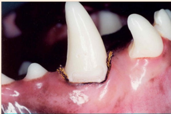
Figure 2: After preparation and measurement procedures were conducted, the 3 teeth of the same semi-arch received a retraction cord that was placed with caution to avoid gingival tissue damage.