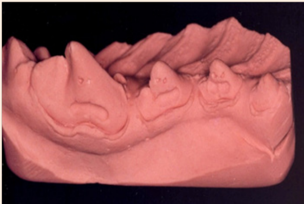
Figure 1: The measurements were taken from the compass.

Duncan's statistical test was applied to the results in the statistical significance interval of P=0.05 .