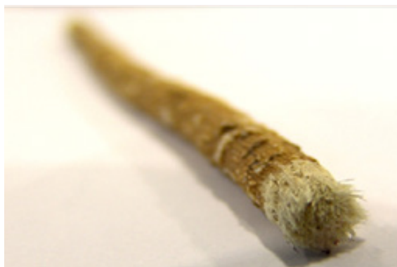
Figure 2 Miswak.

Bristled toothbrushes did not find their place in Europe until the 1600's. 10 The 17th and 18th centuries had dentists in France promoting the use of toothbrushes and slightly later in England. The first written reference to a toothbrush in the English language dates back to 1651 when it was written about in the Memoirs of the Verney Family during the English Civil War. 11 In this reference, it was noted that it was a gift of the new Paris luxury- 'the Teeth Brushes and boxes.' 11 As the Industrial Revolution took hold in Europe the stage was set for manufacturing and consumer goods. 3 William Addis 12 is credited with designing the first mass-produced toothbrush in England, which entered the market in 1780. On the other side of the Atlantic, the first American to patent a toothbrush was Wadsworth HN. 10,12 By 1885, American companies began the mass-production of toothbrushes although a large scale consumer market had not yet been established. 10 The Prophylactic-tic toothbrush made by the Florence Manufacturing Company is one example of an early American-made toothbrush and was the first to sell individually packaged toothbrushes. While toothbrushes in the United States were mass produced by the 1900's,