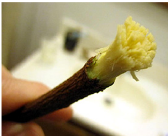
Figure 1 Neem stick.

toothbrush. 5,8 Similarly to Neem, a twig from the Salvadoraceae family of plants was chewed on until the end became frayed into a brush. The brush-end is used to clean the teeth. The beneficial effects of Miswak in respect of oral hygiene and dental health are partly due to its mechanical action and partly due to pharmacological actions. Moreover, the use miswak for oral hygiene is referenced in Muslim hygienic jurisprudence. 9 (Figure 1,2).