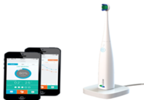
Figure 6 Kolibree smart tooth brush with blue tooth technology.