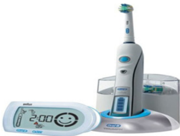
Figure 5 Oral B tooth brush with blue tooth technology.