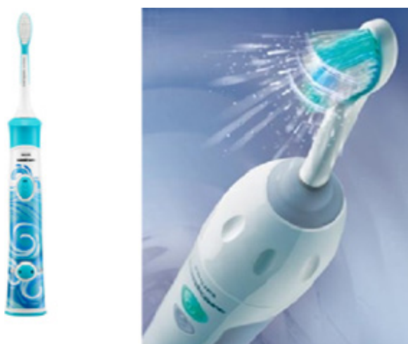
Figure 4 Soni care tooth brush.

and creating prototypes, the Sonicare toothbrush was introduced in November 1992 at a periodontal convention in Florida. In 1995, GEMTech changed its name to Optiva Corporation. In October 2000, Philips Domestic Appliances and Personal Care, a division of Philips, acquired Optiva Corporation. A few months later Optiva Corporation changed its name to Philips Oral Healthcare, Inc. By the end of 2001, Sonicare had become the top selling rechargeable power toothbrush in the United States. 8 In 2003, to improve Philips brand recognition in the US, Philips began rebranding the Sonicare toothbrush as “Philips Sonicare”. The brush head vibrates at hundreds of times per second, with the latest models at 31,000 strokes per minute. Rather than connecting to its charger with conductors, it utilizes inductive charging-the charger includes the primary winding of the voltage-reducing transformer and the fat handle of the brush includes the secondary winding. The replaceable head is also driven magnetically (Figure 4 & 5).