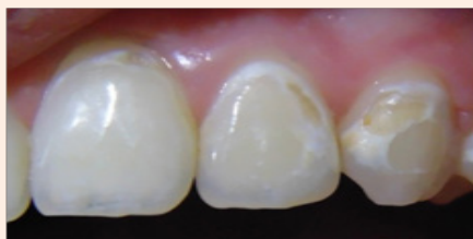
Figure 4B: Angelica one year after 4 weeks tooth mousse.