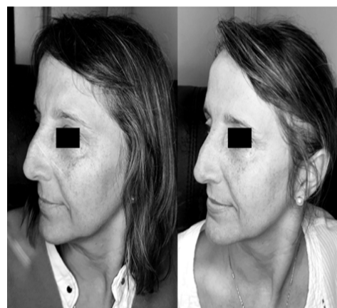
Figure 3 Volunteer of cluster 2, (left) before treatment, (right) after treatment.

The outcomes of the present study join others which were obtained in different studies held by other authors by means of either clinical evaluations, studies on cellular cultures. Also, the antioxidant effect shown for BV which is considered to be a prevention factor of ageing. Also, Han et al. 2015b reported antiageing effects during a 12-weeks treatment with BV serum for analyzing periorbital wrinkles. 7,8,11,24,25,26