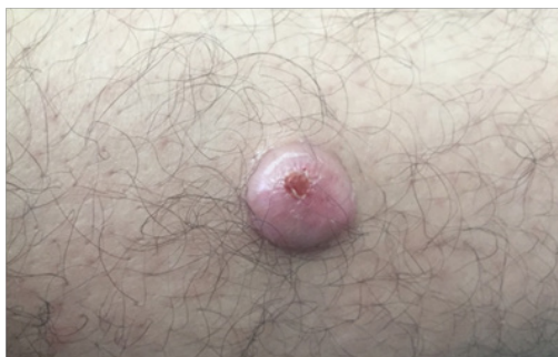
Figure 1 Well-defined nodule, roughly rounded, about 2cm long axes, located at the anterior side of the leg.

A 35-year-old man presented with a solitary nodule on his leg. The lesion had first appeared 3 years earlier as a small skin nodule. The cutaneous lesion was erythematous, well demarcated and measured 3 cm in diameter (Figure 1). The patient had no other abnormalities and no evidence of neurofibromatosis such as café-au-lait spots or cutaneous neurofibroma. Physical examination did not reveal any enlargement of regional lymph nodes.