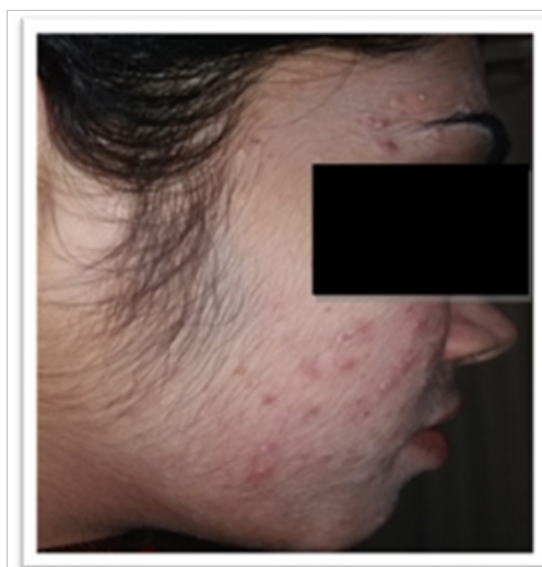
Figure 4 Dapsone gel group after 4wks GAGS-13.