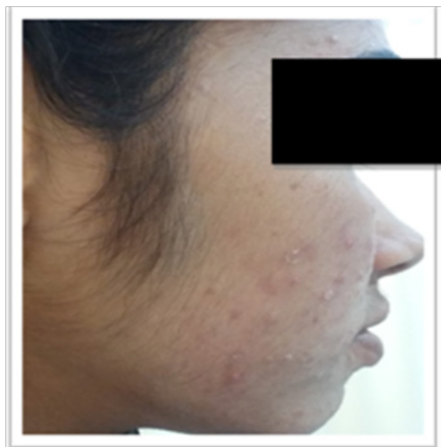
Figure 3 Dapsone gel group before treatment GAGS-18.