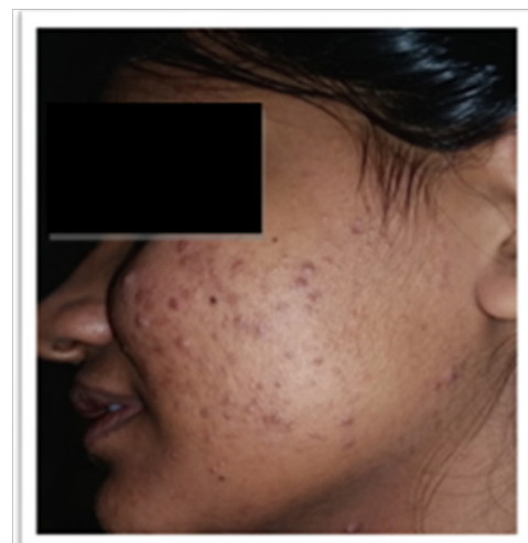
Figure 1 Adapalene-clindamycin group before treatment GAGS-21.

Out of 60, 24 subjects followed-up after 4weeks and reported no adverse events with the medications. 36 subjects who did not follow-up were questioned telephonically. 3 subjects experienced side effects like dryness and erythema (AC group-2, Dapsone group-1) (Figures 1-4).