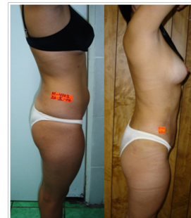
Figure 2 A young girl with small fat deposits in the abdomen and waist. Good case for Liposuction. Before and after.