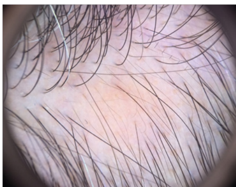
Figure 4 Dermoscopy: vellus hairs surrounded by normal scalp with terminal hairs.