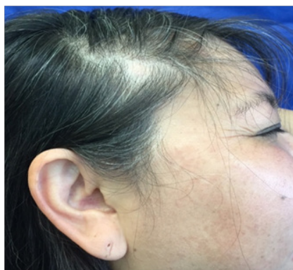
Figure 3 Oval alopecia area 1x1.5cm. No cutaneous alterations such as atrophy, scalling or inflammation.