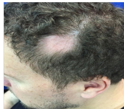
Figure 1 Well circumscribed triangular alopecia area 4X3cm. No cutaneous alterations such as atrophy, scalling or inflammation.

A 48-years-old male presented a localized hair loss in the right temporoparietal region perceived since she was twelve. On dermatological examination was observed an oval area of alopecia, well-defined, measuring 1x1.5cm (Figure 3) without skin changes, such as atrophy, peeling or inflammation. Dermoscopy (DermLite DL3N; 3Gen) reveled in the injured area vellus hairs surrounded by normal scalp with terminals hairs (Figure 4). No yellow spots, exclamation mark hairs or cadaver hairs were detected. He denied similar cases in the family.