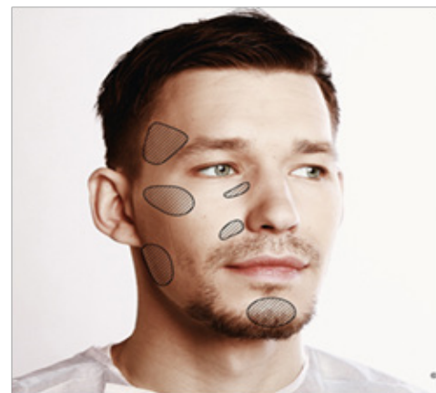
Figure 1 Shows the main areas of filler introduction for volumetric correction of a male patient's face.

should be modeled immediately after injection in order to ensure an even distribution of the filler and a natural looking result.