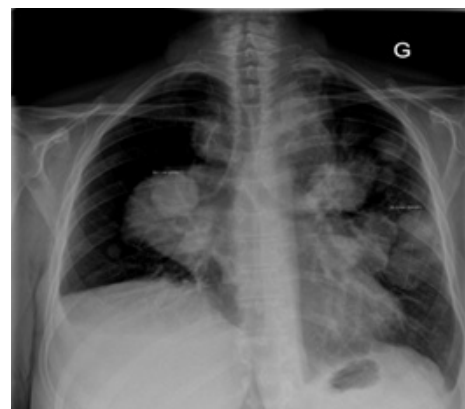
Figure 3 Chest X-ray of the chest with disease progression after 3 months of chemotherapy.

The patient did well through the 4 cycles of chemotherapy. Although her BHCG was normalized, there was still documented metastatic disease in the thorax. She remained well with normal BHCG for three months after chemotherapy and then her BHCG started to rise again and progression of the disease was documented at the level of the chest (Figure 3).