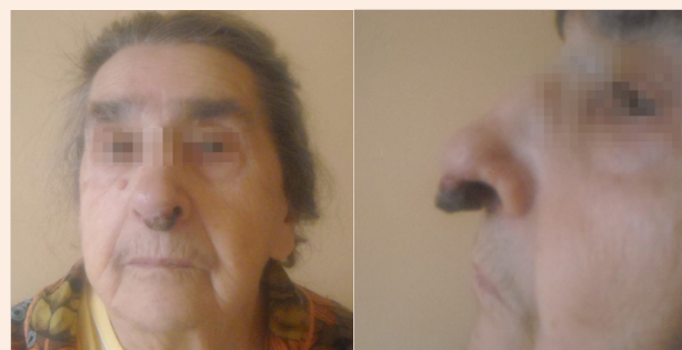
Figure 2: Exophytic NK lymphoma at nasal vestibulum at presentation.