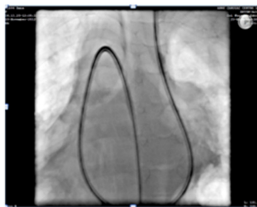
Figure 5 9F delivery sheath negotiated across the bends.

A duct occluder (Shshma, China) size 14/12 mm was attached to the delivery cable and progressed across the delivery sheath (Figure 6). After confirming the precise location of the device in a lateral angiogram right anterior oblique (RAO) 90 degrees, the device was then disengaged (unscrewed) from the delivery cable. Mild residual flow through the device ("foaming") was however encountered immediately following release. Follow-up discharge echocardiogram 24 hours after the procedure, disclosed proper placement of the occluder with no residual flow through the device or across the ductus .