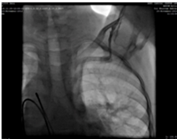
Figure 3 Contrast draining from the left brachial vein into the morphological RA.

A duct occluder (Shshma, China) size 14/12 mm was attached to the delivery cable and progressed across the delivery sheath (Figure 6). After confirming the precise location of the device in a lateral angiogram right anterior oblique (RAO) 90 degrees, the device was then disengaged (unscrewed) from the delivery cable. Mild residual flow through the device ("foaming") was however encountered immediately following release. Follow-up discharge echocardiogram 24 hours after the procedure, disclosed proper placement of the occluder with no residual flow through the device or across the ductus .