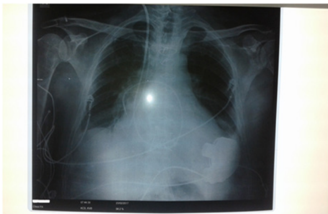
Figure 2 Radiographic findings after LVAD Heart Mate 3 implantation and tricuspid valve reconstruction.

The postoperative course at the clinic for cardiac surgery also regular. The pump speed was set at 4800 rpm, PF 3,4, PP 3,2, PI 3,3, Hct 27. Stable LVAD parameters and data from the controller. Auscultation shows cardiac rhythmic action, clear sound of LVAD pump without variations in intensity. Laboratory and radiological analysis within the reference values (Figure 2). The echocardiography at discharge showed the left ventricle increased in size, smaller in (EDD 6.6, ESD 5.7 cm), normal wall thickness. A slight MR 1+ is recorded into the left atrium with dimensions of 4.6 cm. The right ventricle was of smaller dimensions comparison to the preoperative findings of 2.6 cm, better systolic and longitudinal functions. There was still the presence of TR 1-2+ of eccentric stream directed towards the DP wall. A mild PR 1+ was recorded. The input and output cannulas of device were with excellent colors with the flow rate. The patient and his family were educated regarding the device's functioning (battery charging, alarm registration) and the hygiene of the output area of the drive line. The patient no showed symptoms of heart failure and was physically active. After one month the patient was discharged. On follow-up examination one and two months after discharge, LVAD parameters and data on controller were stable. The LVAD alarms were not registered. The patient was put on the list for a heart transplant.