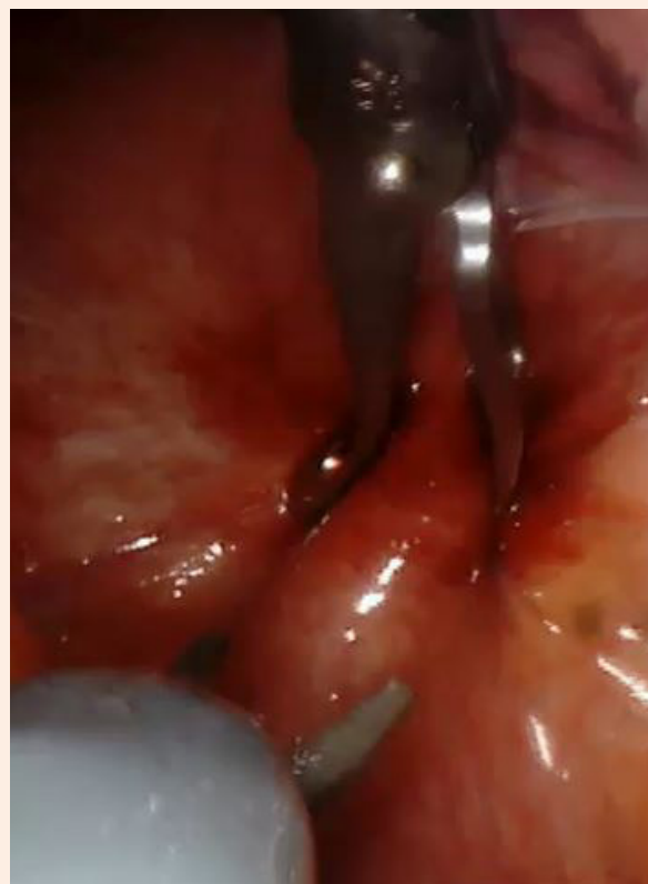
Figure 1: The distended pericardium was grasped and prepared for incision by robotic instruments.

The pleural cavity was examined, and any pleural effusion was evacuated and sent for cytology. The pericardium and phrenic nerve were visualized and the distended pericardium was grasped with forceps and incised anterior to the phrenic nerve with scissors (Figure 1). A pericardial window was created (Figure 2), and the pericardium was sent for pathological evaluation as well as pericardial fluid was collected for cytological and microbiological analysis. A single thoracostomy tube was placed in pleural cavity and connected to underwater seal drainage. The incisions were closed in layers. All patients were transferred to intensive care unit for routine 24-hour postoperative evaluation and returned to ward. The thoracostomy tube was removed when the amount of daily drainage was below 100 mL.