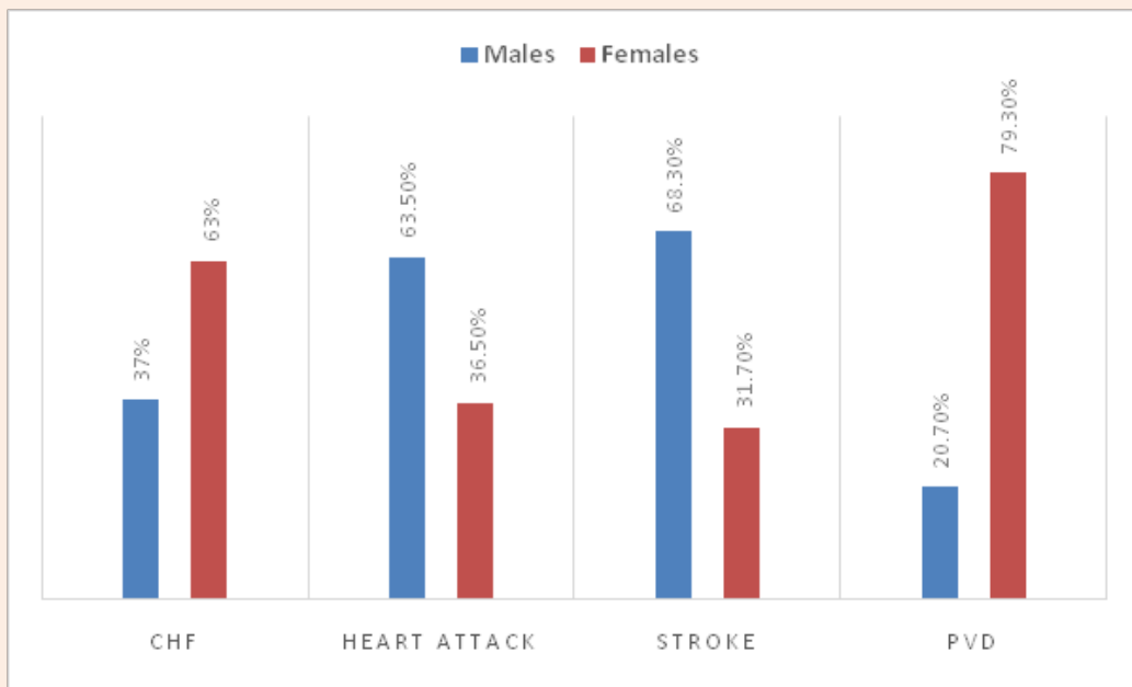
Figure 2: Description of the CVD and CKD stage by sex.