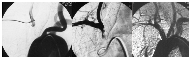
Figure 1 Successful innominate artery PTA and stenting in a 50-year-old woman.

result. No major complication (death, myocardial infarction, stroke) occurred during the immediate perioperative period and trough out all the follow up. Two minor complications occurred in the post-operative period: one patient, with known chronic renal insufficiency, developed an acute renal failure induced by medium contrast, he was treated with dopamine at renal dosage and hydration with reduction of creatinine values (at discharge creatinine values were similar to the those of the admission). Another patients presented hematoma at puncture sites (humeral right artery and femoral right artery), treated with manual compressions and compressive dressings without sequela. All patients have remained symptoms free throughout follow-up and eco-Doppler controls of SATs documented the maintenance of the good angiography result.