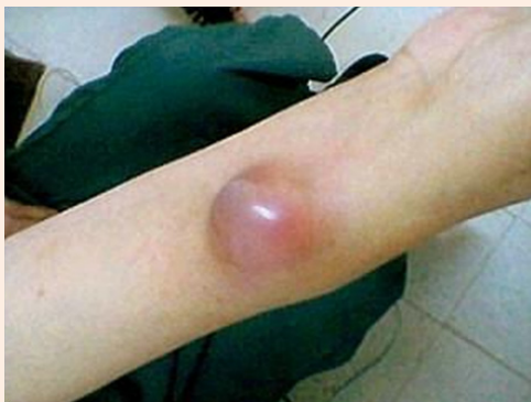
Figure 1: Image of right radial pseudoaneurysm with area of swelling noted at radial access site.

Colour Doppler ultrasonography demonstrated a pseudoaneurysm with partial thrombosis (Figure 2). A conservative therapy with prolonged local compression failed to close it. The patient required surgical correction. She underwent surgical excision of the pseudoaneurysm and suture of the radial artery. She remained well at follow-up after the procedure, with preserved radial arterial pulse and no residual swelling.