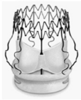
Figure 1 The two collapsible aortic sutureless bioprotheses: Medtronic 3f Enable model 6000 and Sorin Perceval S with the in-aortic root frames.