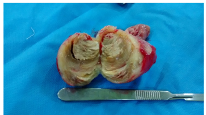
Figure 3 Big white organized thrombus removed from the diverticulum cavity with calcified nucleus(central zone).

The postoperative course was uneventful. All haemodynamic parameters were in normal range. The patient was discharged with normal sinus rhythm on fifth postoperative day. The patient has remained in sinus rhythm for 3months postoperatively, and transesophageal echocardiography revealed no LA thrombus, no evidence of residual LA diverticulum.