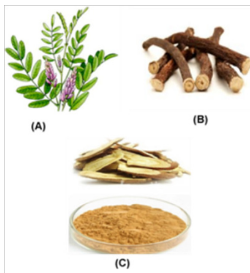
Figure 1 (A) Flowering (aerial part) plant parts of Glycyrrhiza glabra Linn. (B) Root of the plant, and (C) powdered form of the plant root used in traditional system of medicines.

The Glycyrrhiza genus contains more than 30 species and widely distributed all over the world. 7 Glycyrrhizagenus plants are wide spread in Mediterranean, Southern and Central Russia and Asia, being minor to Iran. Many species are now grown throughout Europe, Syria, Asia, UK, USA, Italy, France, Germany, Spain, China, Middle East, Central and South Western Asia and the Mediterranean region, which is basin of Africa, in South Europe, Afghanistan and Northern India (Punjab and Sub-Himalayan regions). Large-scale commercial cultivation is available in Spain, Sicily and England. 8,9