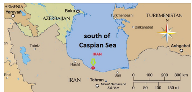
Figure 1 The South of Caspian Sea included in this study (A: fish farm).

This study was carried out in an offshore fish farm in the southern region of the Caspian Sea (36°, 47', 12" N and 51°, 7', 50. 2" E) with a distance of 5.6km from the coast in a water depth of 32m (Figure 1). This research was conducted in 2017-2018 in a marine farm in the central region of the southern Caspian Sea.