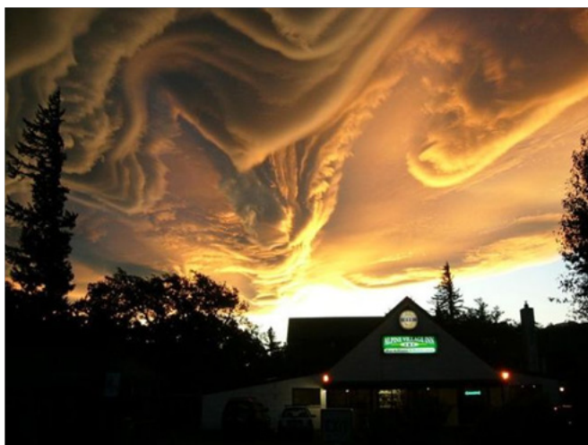
Figure 2 The growth of artificial vapors continues with the development of industry and our comfort.

began to appear where they had never been - in the deserts. 9 The usual rhythm was brought down: in the past three years, the rains in Atacame were frequent (March and August 2015, and then June 2017).