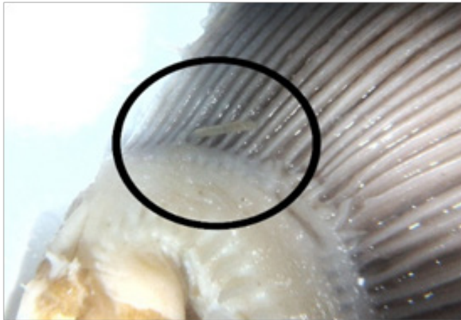
Figure 1 Female adult of L. cyprinacea on the gill filament of Acipenser stellatus from Rajae Aquaculture Center, 2014. Magnification: 10x.