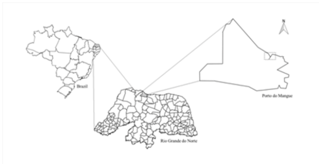
Figure 1 Map of Brazil showing the Rio Grande do Norte region and the sampling site Porto do Mangue (estuary).

The oysters passed through biometrics, where all measurements of shells were taken in millimeters (mm) and subsequently kept in aquariums of 20L (20 liters) in the closed system with sea water and aeration, where the oysters were kept for over 24h before processing for the isolation of Perkinsus sp.