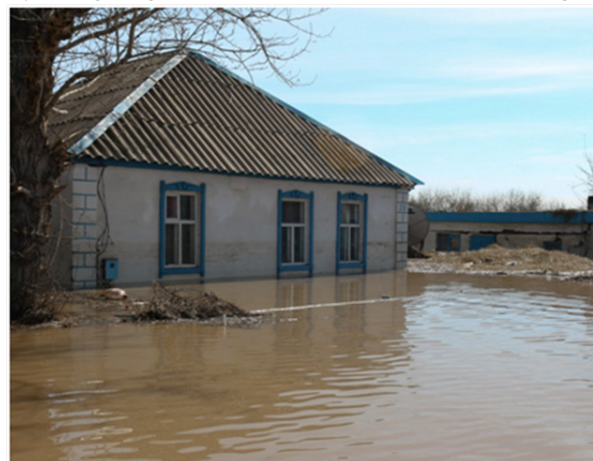
Figure 4 Flood Situation on the territory of the North-Kazakhstan region.