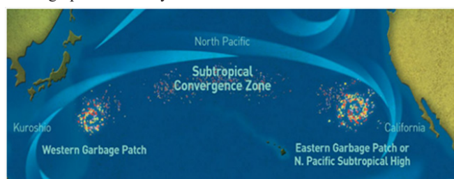
Figure 1 The Great Pacific Garbage Patch. 2

concentrated pollution, typical of coastal aquaculture. It is also an observation of the authors of this work that the offshore aquaculture industry in Malaysia is more than often, highly disjointed and utilizing obsolete technologies, hence not tapping its full potential. Taking note on the gravity of the depleting wild stock shortage alongside the fact that our oceans contain micro-pollutants that may not be visible to the naked eye, there is a need for the presentation of a proper techno-economic model to guide marine farmers in striving for sustainable marine farming developments. We define sustainable herein from the context of both the environment and its end users which eventually consume the food product. It is the intent of this paper that focus be given towards far-coastal and offshore aquaculture due to their massively untapped potential. The case will be presented around a Malaysian context, but may be applied to other regions with similar oceanographic and bathymetric conditions.