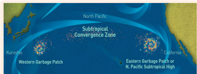
Figure 1: The Great Pacific Garbage Patch [2].

with other users of the coasts comprising of industries from eco-tourism to infrastructure developments. Moving further seawards, offshore aquaculture is the recent development of bringing marine farming to deeper waters further out at sea which will avoid competition and concentrated pollution, typical of coastal aquaculture. It is also an observation of the authors of this work that the offshore aquaculture industry in Malaysia is more than often, highly disjointed and utilizing obsolete technologies, hence not tapping its full potential. Taking note on the gravity of the depleting wild stock shortage alongside the fact that our oceans contain micro-pollutants that may not be visible to the naked eye, there is a need for the presentation of a proper techno-economic model to guide marine farmers in striving for sustainable marine farming developments. We define sustainable herein from the context of both the environment and its end users which eventually consume the food product. It is the intent of this paper that focus be given towards far-coastal and offshore aquaculture due to their massively untapped potential. The case will be presented around a Malaysian context, but may be applied to other regions with similar oceanographic and bathymetric conditions.