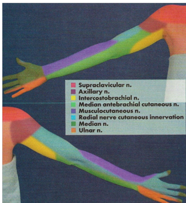
Figure 2 Peripheral nerve innervation (anterior and posterior surfaces).

The following parameters were also evaluated: 1) onset anesthesia, considered the time between anesthetic injection (lidocaine and levobupivacaine) and loss of sensitivity in the studied area of the