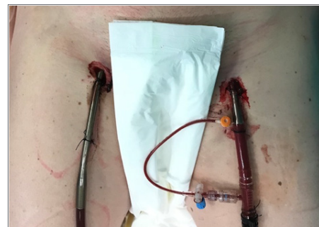
Figure 1 17Fr venous sheath (black arrow) and 24Fr arterial sheath (black pointer) with distal perfusion cannula in patient's right and left groin respectively. This was inserted percutaneously by critical care physicians.

Received: January 22, 2018 | Published: June 6, 2018