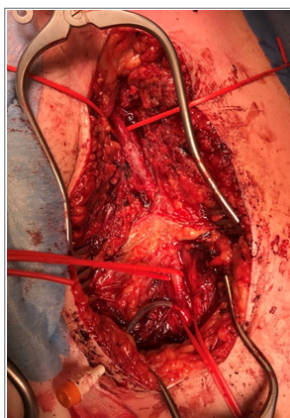
Figure 5 Arterial sheath removed. Long saphenous vein path angioplasty to superficial femoral artery (black arrow). Distal reperfusion cannula in-situ distal superficial femoral artery (black pointer).