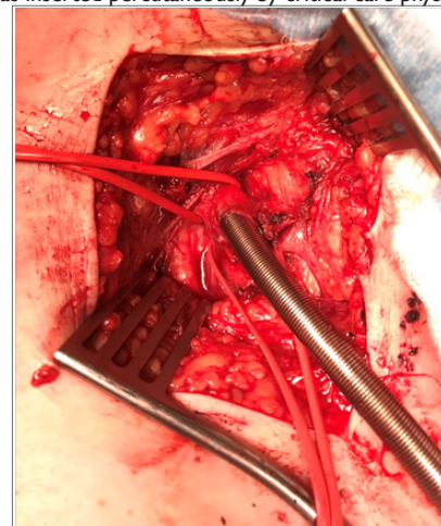
Figure 2 Venous sheath in-situ common femoral vein (black arrow) with sloops for proximal and distal control.