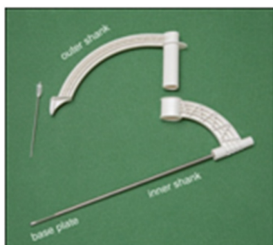
Figure 1 The SafeTrach device unassembled.