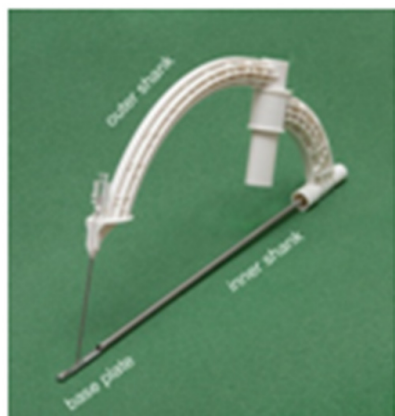
Figure 2 The SafeTrach device assembled.