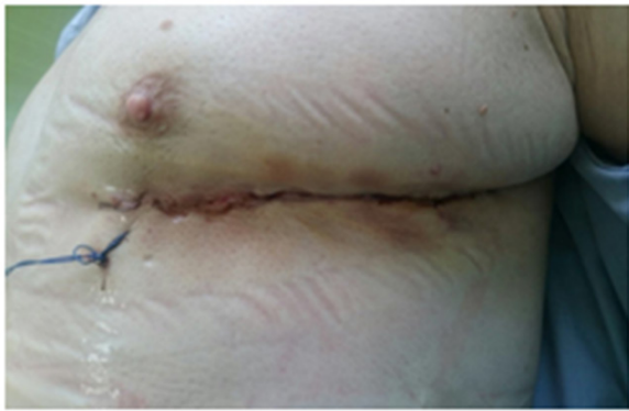
Figure 2 Type of wounds after repeated operation of coronary bypass surgery.

technical difficulties, the use of MICS, in repeated operations, allows the successful implementation of a myocardial revascularization, minimizing the risk of complications associated with re-sternotomy and damage of functioning grafts.