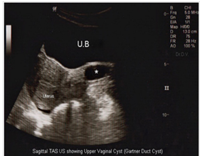
Figures 2&3 Computed tomography demonstrated a multiloculated, cystic mass left of the vaginal cuff.