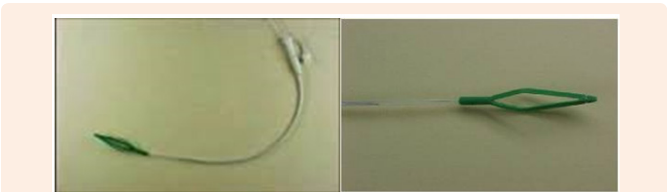
Figure 5: The Hunsaker Mon-Jet infraglottic ventilation catheter. Note that an instructional video demonstrating the use of the Hunsaker Mon-Jet infraglottic ventilation catheter can be seen online at https://www.youtube.com/watch?v=51Y90-xr7Dg