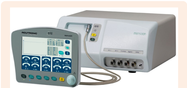
Figure 4: The Acutronic Monsoon III automatic jet ventilation system.