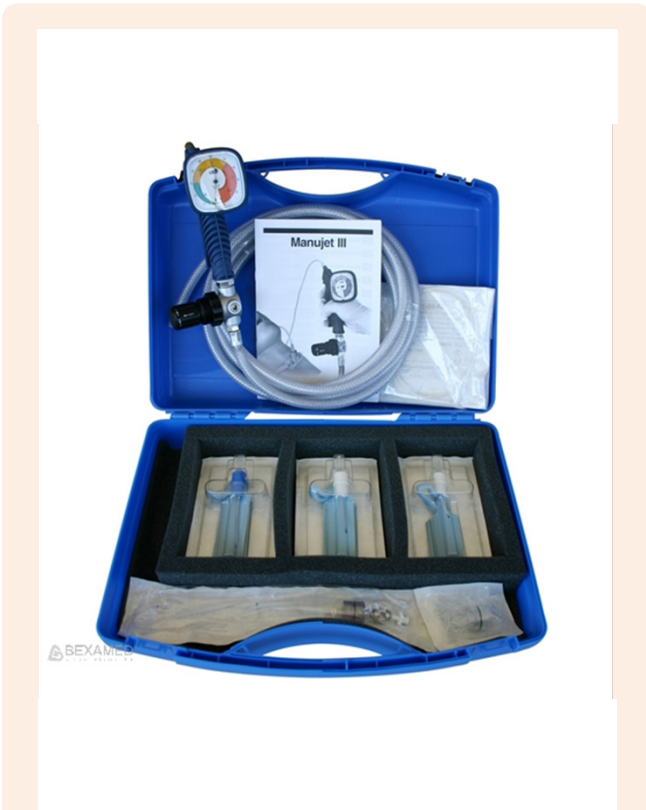
Figure 2: The Manujet III (VBM Medizintechnik GmbH, Germany) is a portable and easily adjusted medical device that can be used for manual jet ventilation. A color-coded gauge shows the proving pressure in bar and psi units. The gas driving pressure can be adjusted between 0 and 3.5 bar (0 to 50 psi). Note that 50 psi of driving pressure is in the range of 3500 cm H 2 O and so can readily produce barotrauma (e.g., a pneumothorax) if not used with caution. Most of the time a driving pressure in the range of 20 psi or less is used.