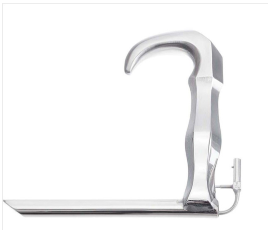
Figure 3 An anterior commissure laryngoscope for use in otolaryngologic procedures. Such laryngoscopes are commonly used in conjunction with a hand-held jet ventilator such as that shown in Figure 2, but in some cases jet ventilation can be avoided by using a narrow bore endotracheal tubes such as the MLT endotracheal tube (Figure 1).