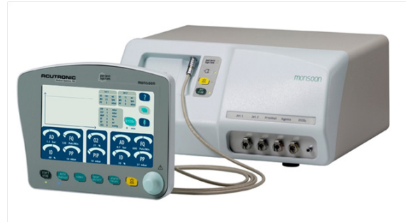
Figure 4 The Acutronic Monsoon III automatic jet ventilation system.