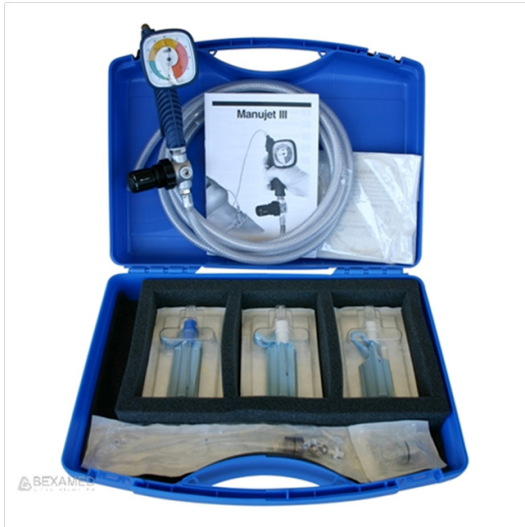
Figure 2 The Manujet III (VBM Medizintechnik GmbH, Germany) is a portable and easily adjusted medical device that can be used for manual jet ventilation. A color-coded gauge shows the proving pressure in bar and psi units. The gas driving pressure can be adjusted between 0 and 3.5 bar (0 to 50 psi). Note that 50 psi of driving pressure is in the range of 3500cm H 2 O and so can readily produce barotrauma (e.g., a pneumothorax) if not used with caution. Most of the time a driving pressure in the range of 20 psi or less is used.

high as 50psi (=3500cm H 2 O pressure). This is particularly true if gas trapping due to inadequate expiratory pathway takes place.