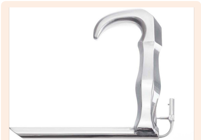
Figure 3: An anterior commissure laryngoscope for use in otolaryngologic procedures. Such laryngoscopes are commonly used in conjunction with a hand-held jet ventilator such as that shown in Figure 2, but in some cases jet ventilation can be avoided by using a narrow bore endotracheal tubes such as the MLT endotracheal tube (Figure 1).